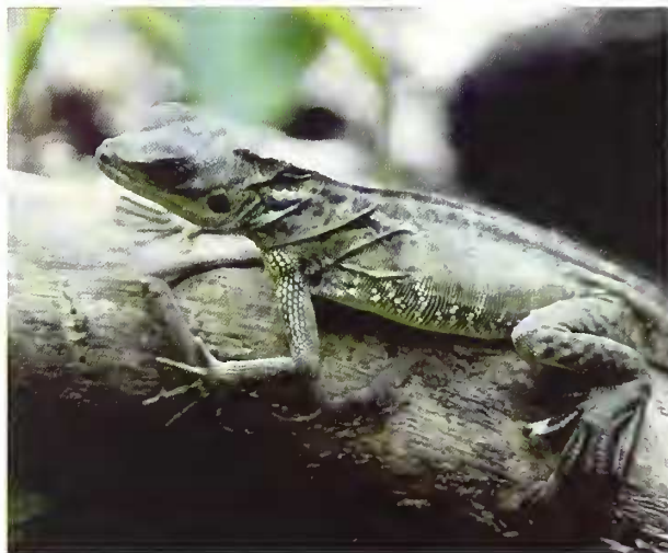
Fig. 8. Hydrosaurus sp. from Salibabu Island.

with six groups of two to six tubercular, carinate scales; three further such enlarged scales along the side of the neck; towards the ventral side numerous enlarged, smooth scales arranged in more or less distinct transverse rows; ventral scales homogenous, smooth; subdigitals under fourth toe small at basis, followed by 35 relatively enlarged subdigitals after first phalanx; toes laterally with a row of extremely wide (up to 1.9 mm) scales, 36 at fourth toe forming a serrated edge. Ten and eleven femoral pores, respectively. Ground color green to brownish with enlarged scales of the dorsal and lateral side being lighter; ventral side whitish, throat darker.